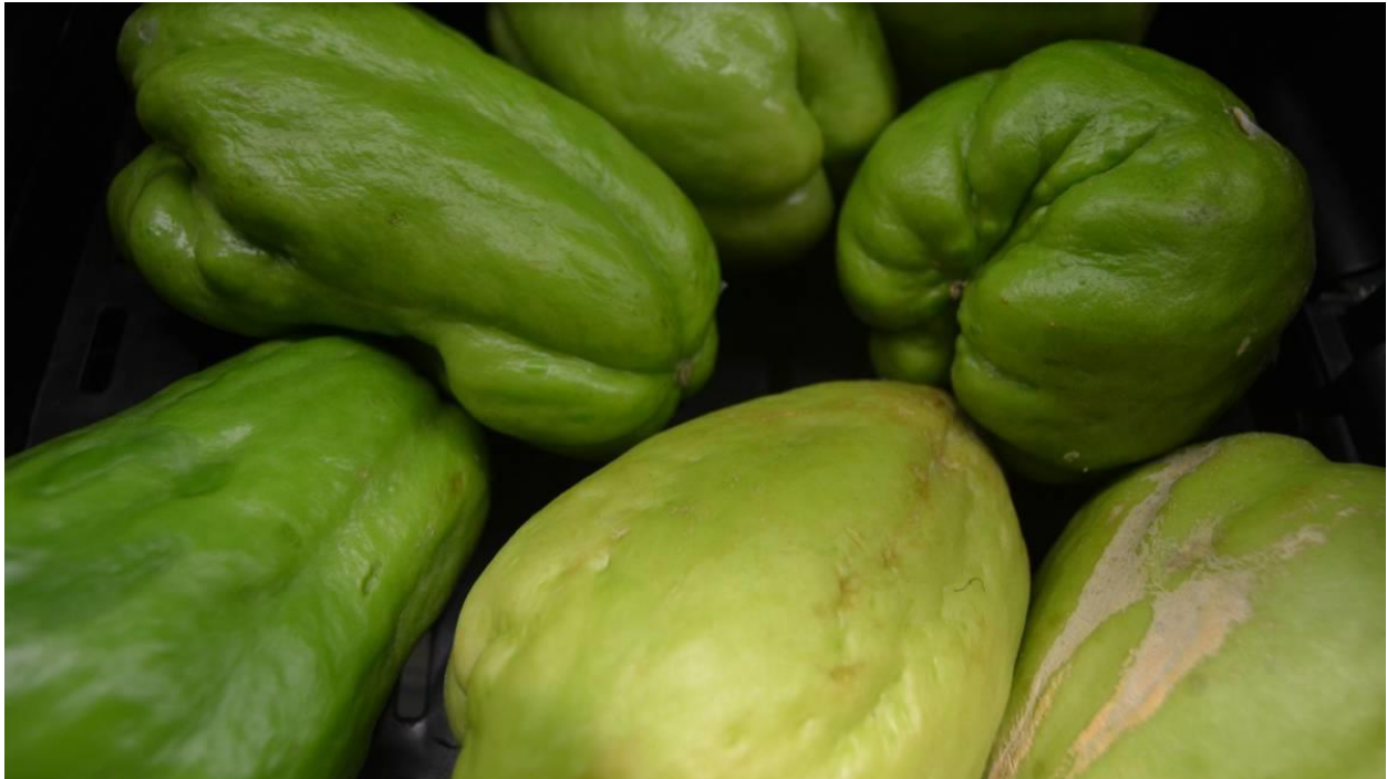
PACKS A PUNCH: Col Liddicoat believes "the possibilities are endless" with chokos.

Maybe it is true - people really do go loco for chokos.